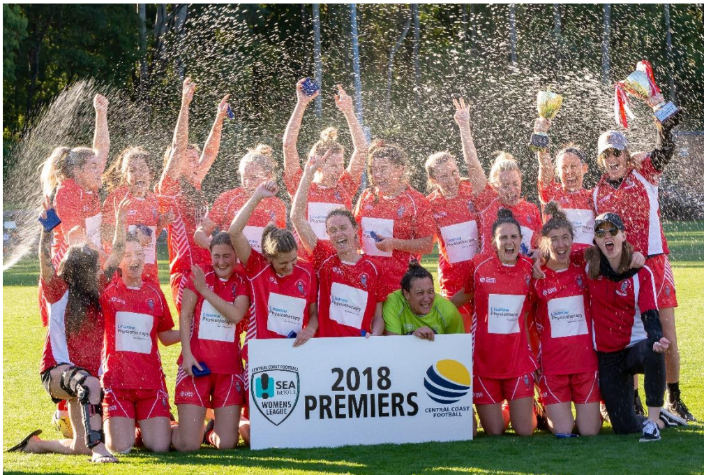
Gosford City 1 st Grade League Champions and Grand Final Winners