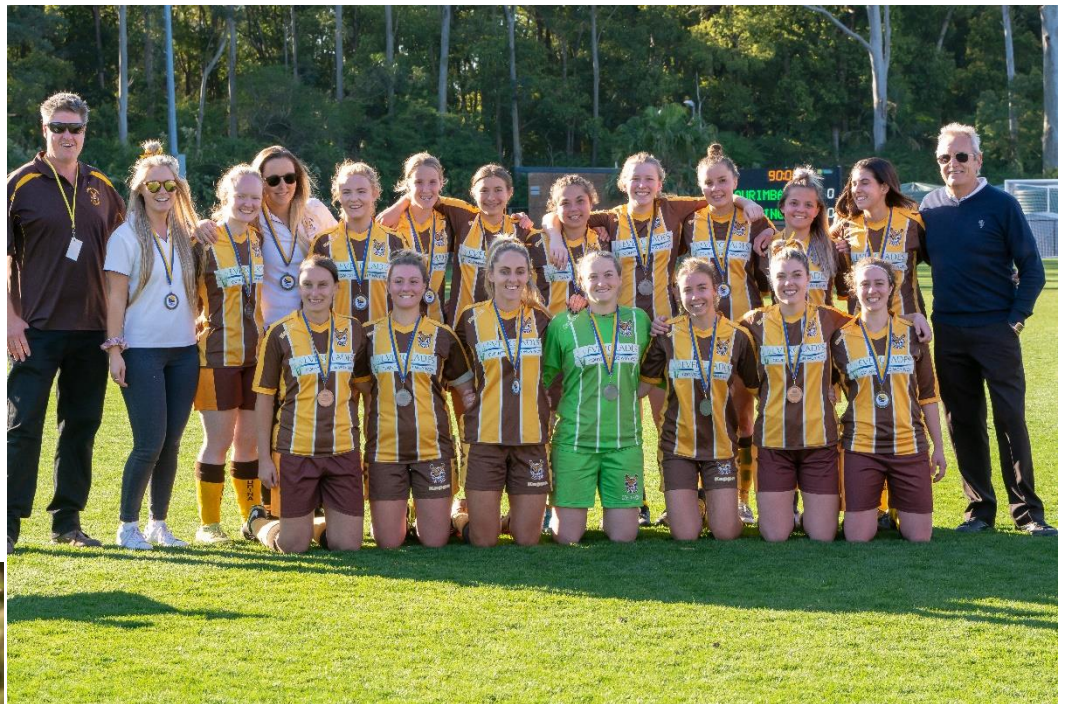
Umina United FC 1 st Grade Grand Final Runner Ups