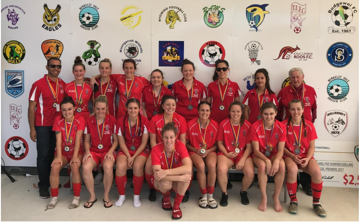
Gosford City FC 1<sup>st</sup> Grade Grand Final Runner Ups