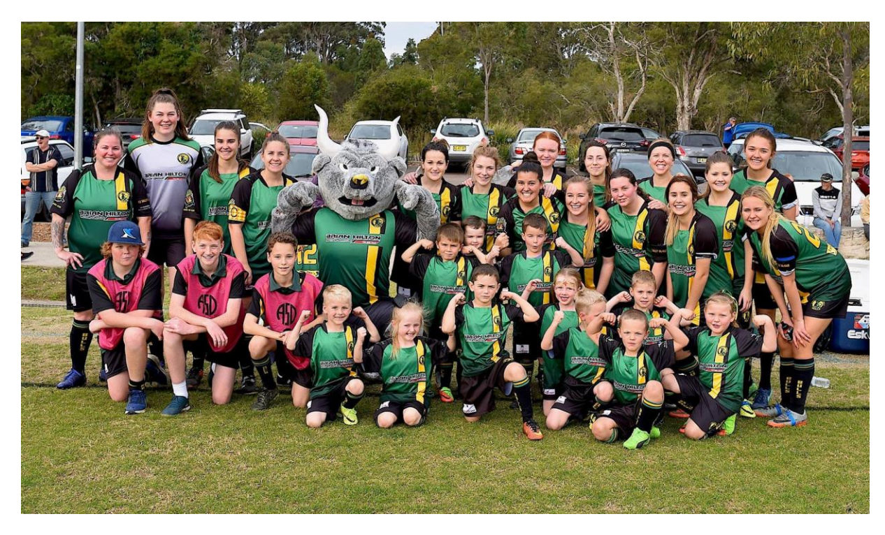
2017 Central Coast Football Annual Report