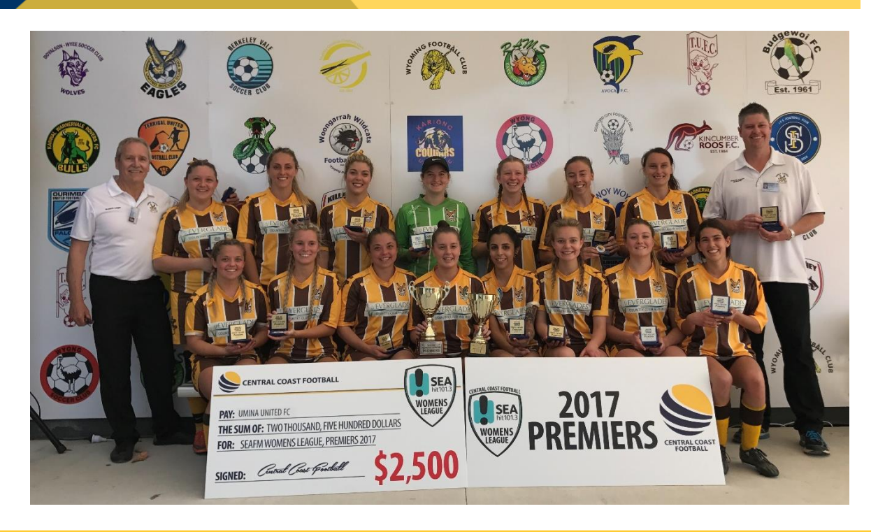
Umina 1<sup>st</sup> Grade League Champions and Grand Final Winners